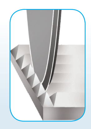
Diamond Grinding Wheel forms a "V" through the inserts to create the teeth.