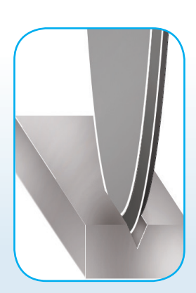
Diamond Diamond Grinding Grinding Wheel forms a "V" Wheel. shape into the face of the carbide inserts.

Our process uses Creep Feed technology to diamond grind individual teeth into the hard, wear resistant tungsten carbide to produce precise, super sharp teeth with a well-defined point and inserts with superb gripping properties.